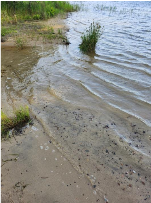
Photo 1. Shoreline at Bakers Pond on June 26, 2024.