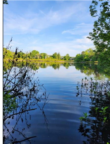
Photo 1. Dolichospermum scum sample collected at Boland Pond on 6/5/24 Photo 2. Edge of Boland Pond where scum sample was collected 6/5/24 Photo 3. Boland Pond view across the pond 6/5/24