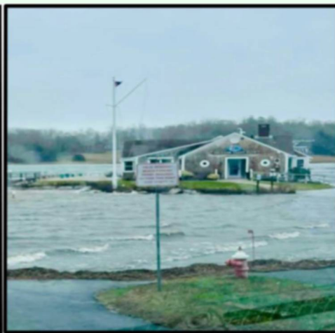
Orleans Yacht Club post storm surge 2024

June 18th, Cape Coastal Conference is Back!