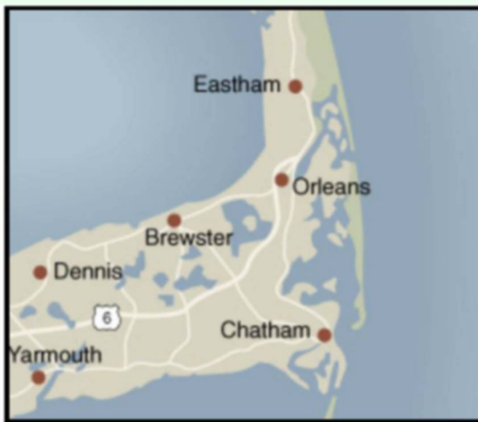
Orleans has 54 miles of coastline.