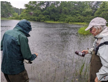
Photo 5: Ice House Pond with diligent volunteers in the heavy rain 6/27/23.